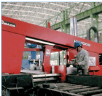
HK-1000 Band Saw