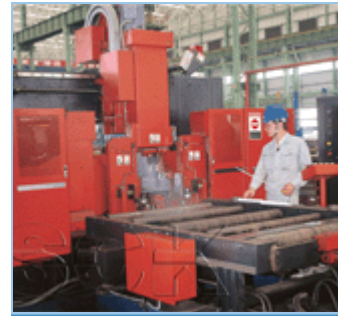
6-Axis NC Driller