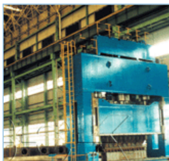
2000T Oil Pressing Machine