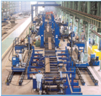
BH-Steel Assembly Line