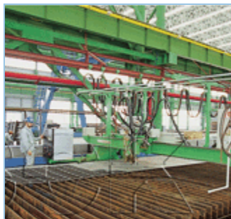
N/C Plasma Cutter