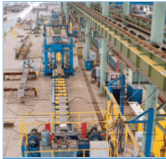
BOX column assembly line